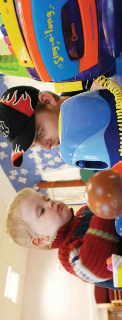
Roundabout and City View East Sure Start Children's Centres Annual Performance Report 2008/09