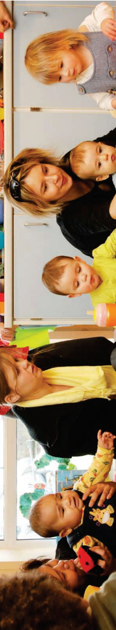
Roundabout and City View East Sure Start Children's Centres Annual Performance Report 2008/09